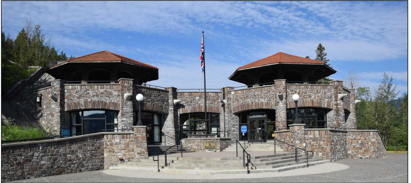
The Bathing Pavilion building at Cave and Basin National Historic Site, Banff, Alberta

DESCRIPTION OF OPPORTUNITY: Parks Canada Agency and the Whyte Museum of the Canadian Rockies seek up to three Indigenous Artists to create temporary mural paintings, to be displayed prominently on the grounds at Cave and Basin National Historic Site. This call is open in 2022 to all Indigenous Artists 18 years of age and older from Îyârhe Nakoda (Stoney), Niitsitapi (Blackfoot) and Tsuut'ina communities who are looking to increase their knowledge of mural painting and large-scale public art-making.